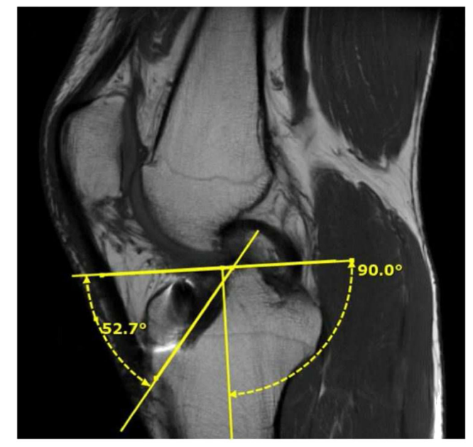
Fig. 1. Post-operative 1.0-T magnetic resonance imaging showing coronal femoral graft angle measurements in the anteromedial approach. A line estimating the level of tibial plateau was used as an approximation of the joint line. A second line was then drawn through the femoral tunnel of the medial femoral condyle, and the angle between the lines was calculated to determine the femoral graft angle.